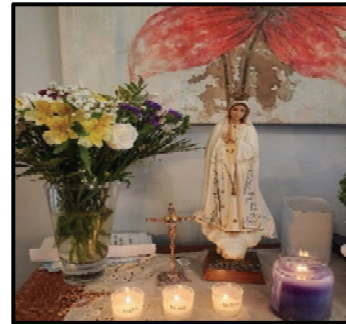
Statue of the Blessed Virgin Mary at Galicia Family

You can have the statue of the Blessed Virgin Mary visit your family for a week or more. This is an opportunity to invite the whole family to pray (booklets are provided), and come together to build, pray for one another's needs, and share your blessings. You also may request for the pastor to visit you at one of these evenings and pray for and with your family. Let the office know to reserve the Visiting Statue with your family.