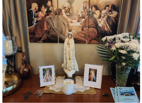
Statue of Blessed Virgin Mary at McCormick Family